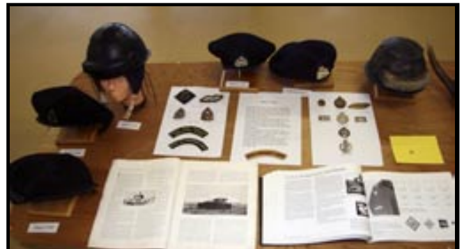
Hats and helmets