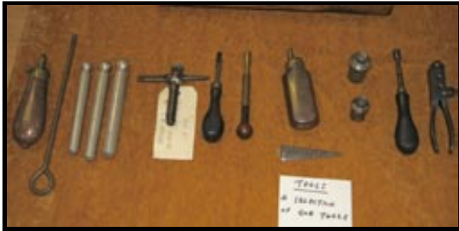
Tools - A selection of gun tools.