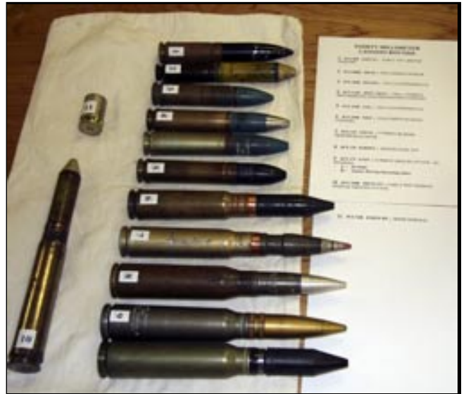
Thirty millimetre cannon shells