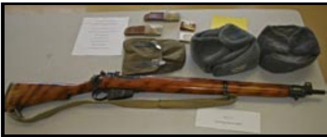
Tiger striped stock on a No 4 303 etc