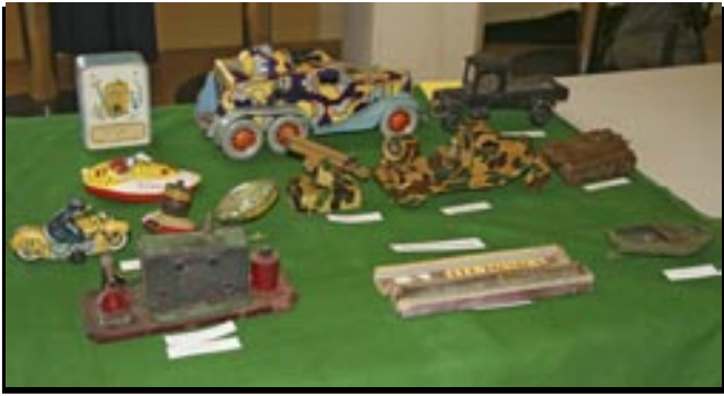
Military tinplate toys