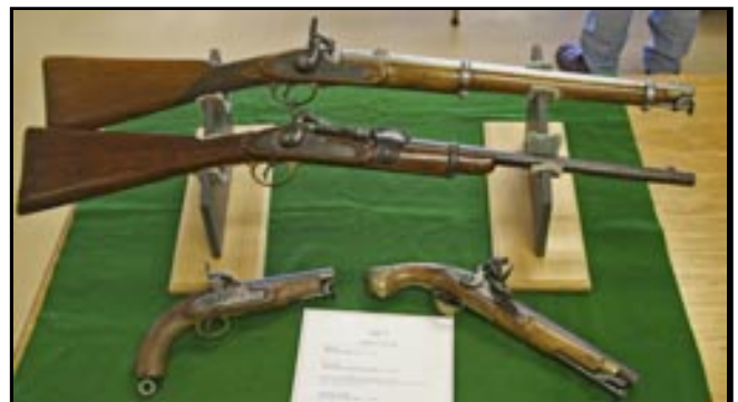
Tower locks in various configurations