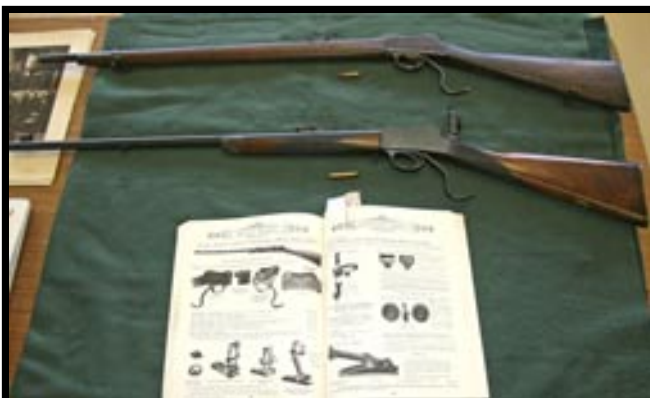
Target rifles - Martini action Single Shot rifles