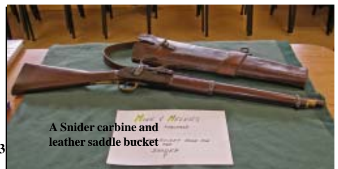
A Snider carbine and leather saddle bucket