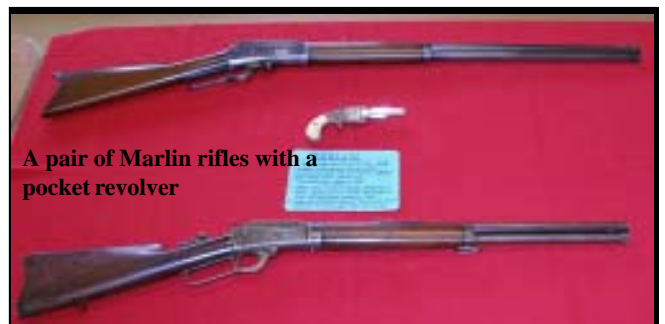
A pair of Marlin rifles with a pocket revolver