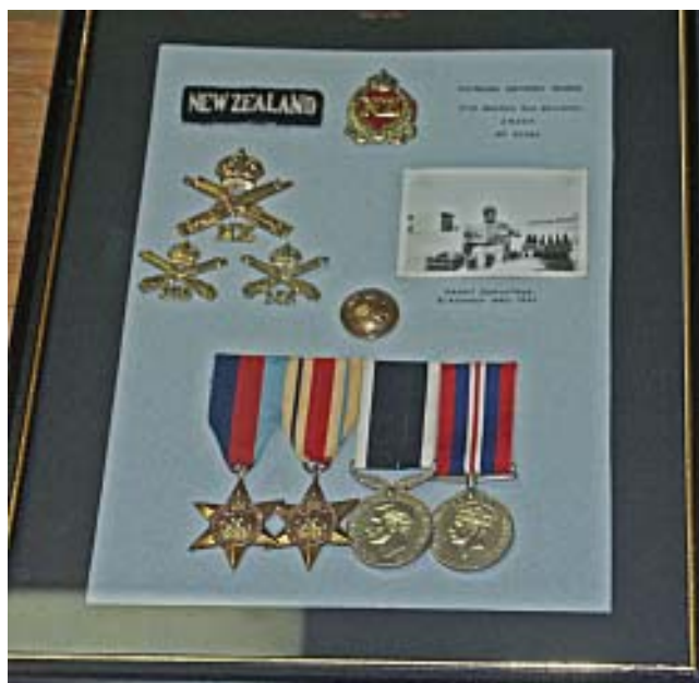
Medals and Badges issued to a NZ Soldier