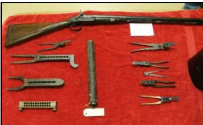
Muzzle Loading shotgun and selection of bullet moulds