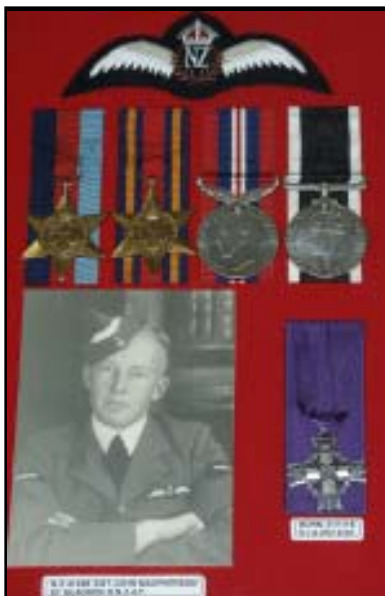
Another fine display of an RNZAF Pilot from 67 Squadron together with his Wings and medals

Subscriptions. A few people have neglected to renew their 2006 subs. If you are one of these persons please attend to this matter promptly. Reminders have been dispatched.