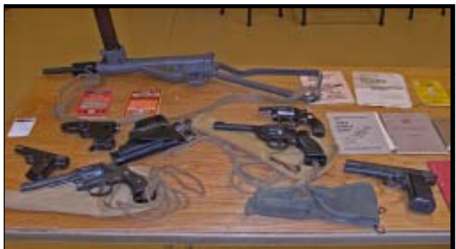
Militaria display with a Sten gun and numerous handguns ets