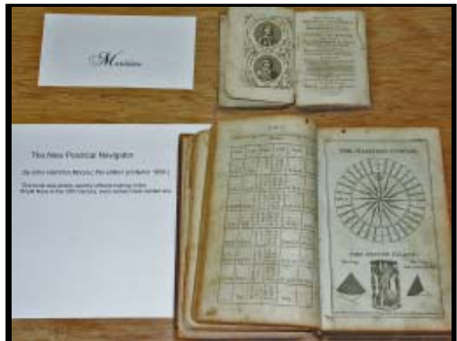
A 206 year old copy of J.H.Moore's - The Practical Navigator along with other nautical items of historic interest.