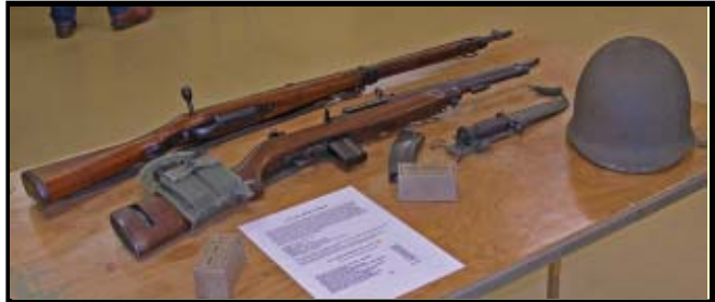
Japanese Arisaka and US M1 Carbine with bayonet, magazines etc