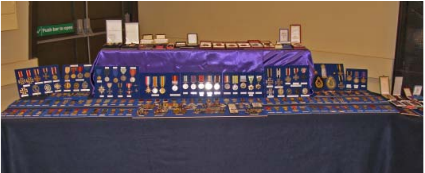
A really marvellous display of medals at our April meeting. Top view showing the extent of the set-up and the two below showing a close up selection of parts of the display. Note that the medals are all identified with typed labels