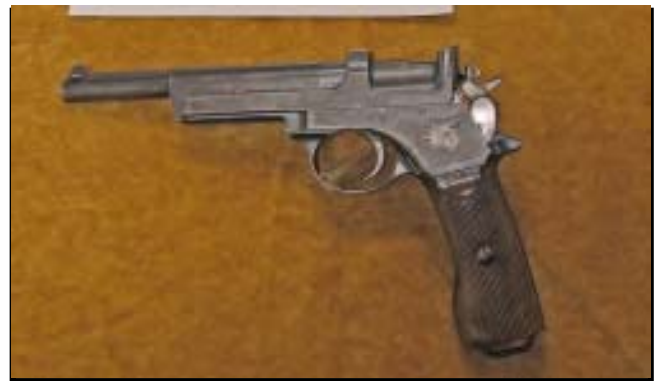
Mannlicher Model 1901 Semi Auto pistol displayed