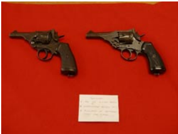
Pistols with consecutive serial numbers