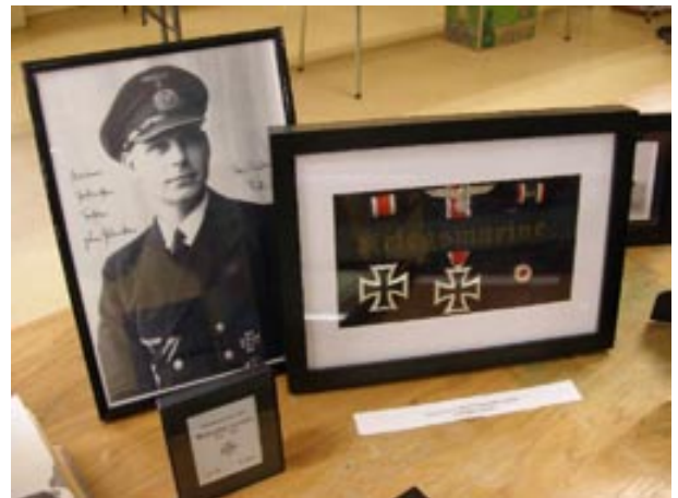
German naval officer & assorted medals