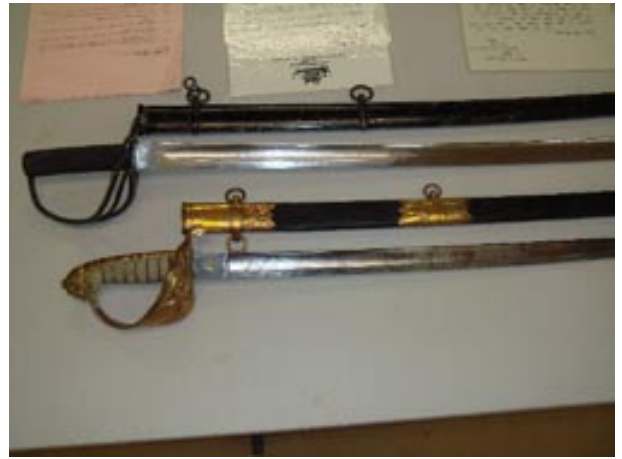
A pair of presentation swords