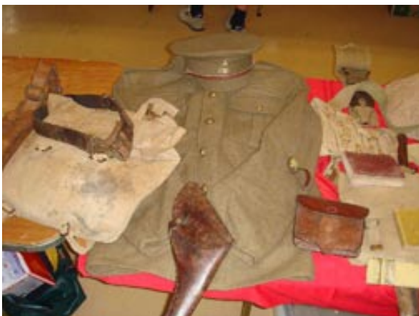
British WW1 uniform & accessories