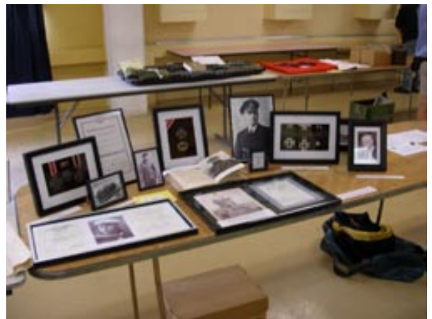
A magnificent display of German U-Boat memorabilia