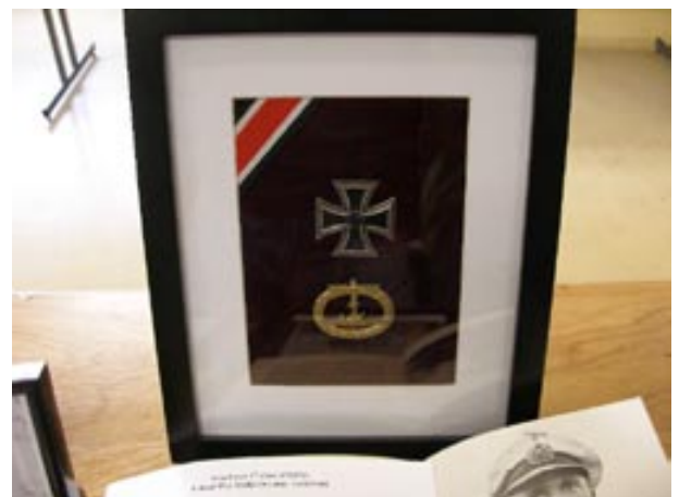
Iron cross 1st & 2nd class with U-Boat service badge