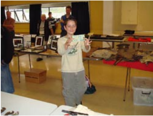
Having a good day