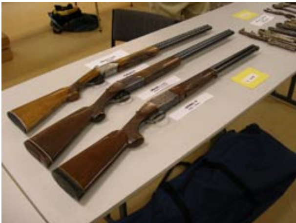
Under and Over Shotguns