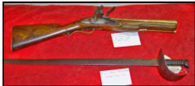
Naval Cutlass and brass barrelled muskatoon dated