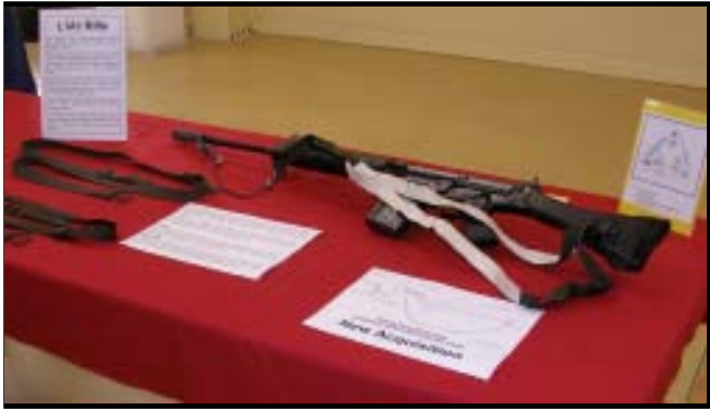
A new acquisition - Arctic sling for the L2 A1 Self Loading rifle