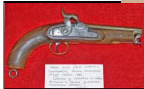
A fine example of an English Tower percussion Naval issue pistol dated 1846.