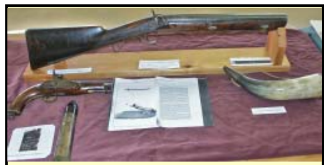
An exceptional display of Naval items