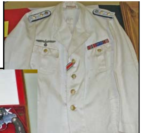
Displays of Knives (left) New Service Colt target revolvers (centre) and a German Naval Officers tunic.