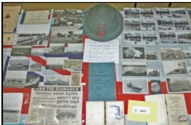
Another most interesting display, a chronicle of the war service and experiences of a New Zealand Serviceman in WW2 who served in the Royal Navy. This display took in so much detail that it was impossible to summarise in a few words. The sort of display that should be on permanent exhibition for all to see in a place like Te Papa or Waiouru