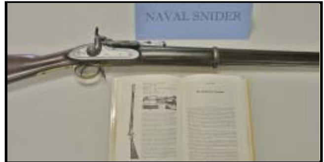
A rather nice Naval Snider displayed at the May meeting.