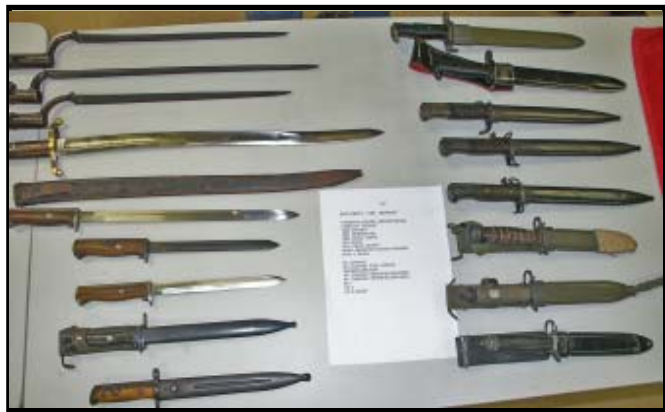
A good display of Norwegian bayonets

We all started off our collecting careers by looking at the valuable items the "Old Timers" displayed, items which we then could not afford. They imparted their knowledge to the younger ones coming through and helped to nurture the collecting spirit and today we don't want to dampen their collecting spirit either, so would like to educate them that if they are not invited to pick up an item for a closer look, just leave it alone and "look with your eyes only and don't touch"