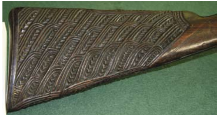
A item that features in our next auction

Remember to check your Firearms Licence expiry date