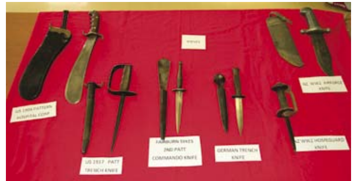
Knives and daggers

We will have some brochures at the next meeting for anyone interested.