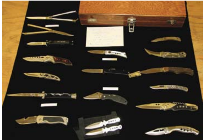
Different style Knives