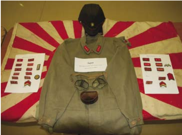
Japanese uniform and insignia

If you would like to help or be involved contact Alwyn, or for further information on open days contact U.H.C.C.