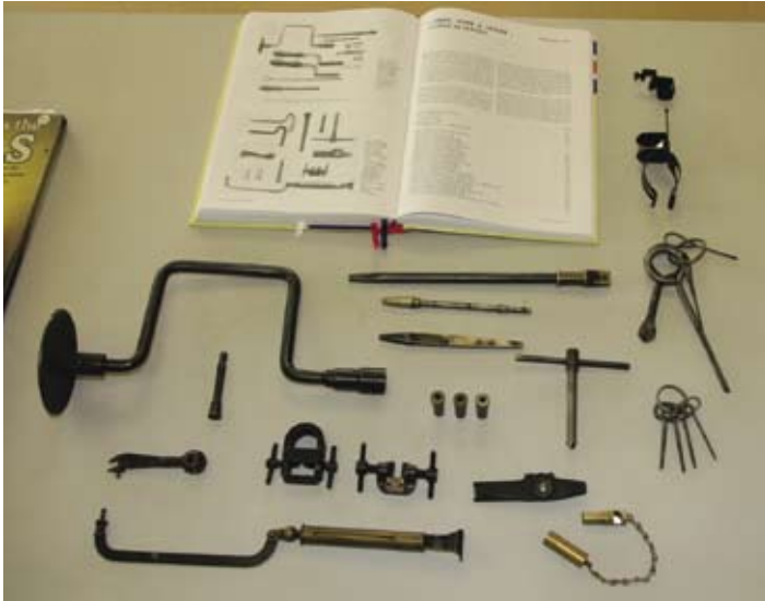
Lee Enfield tools and training sights