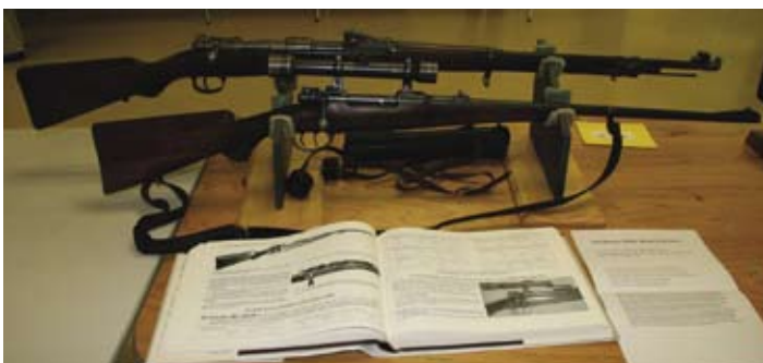
Two Mauser K carbines