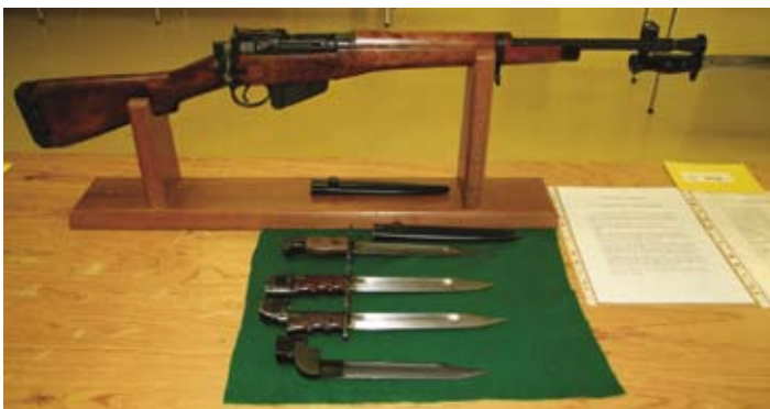
Jungle carbine and bayonets