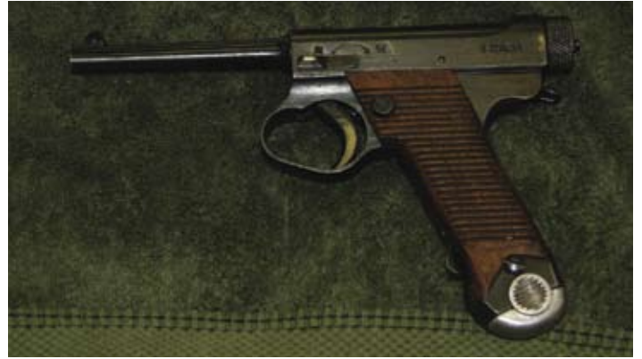
Japanese Nambu handgun