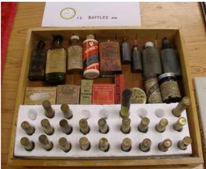
Lee Metford and Lee Enfield oil bottles