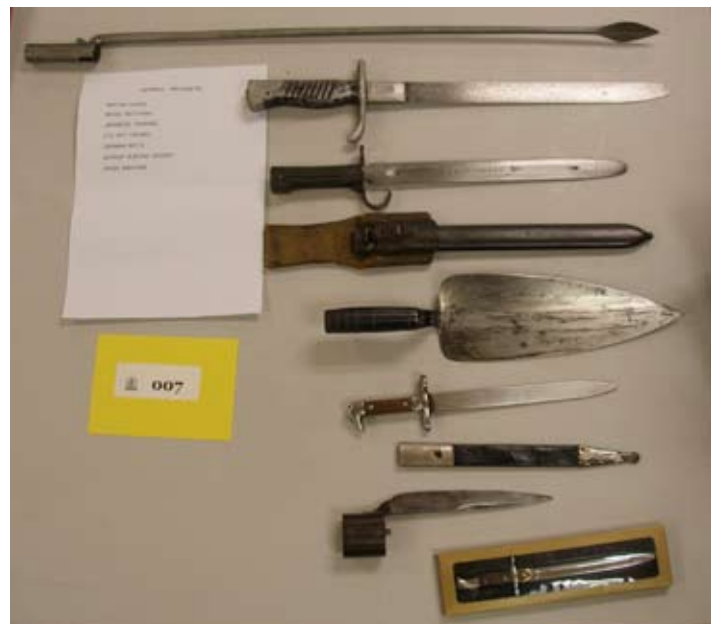
Odd ball bayonets