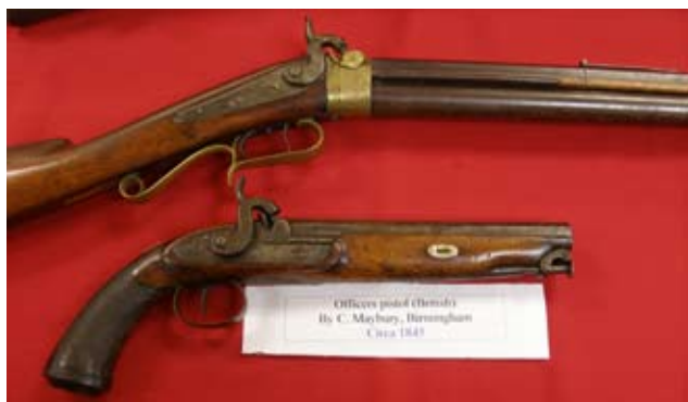
Officers pistol by Maybury