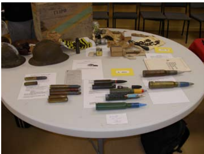
Orlikon developed cartridges