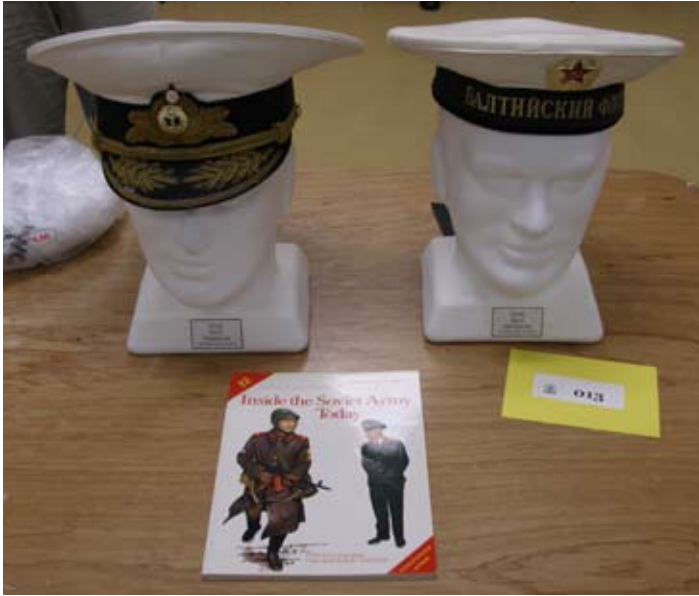
Soviet Naval caps

Owned by Roger, a complete case of hand grenades with all there bases and fuses, in very good condition .