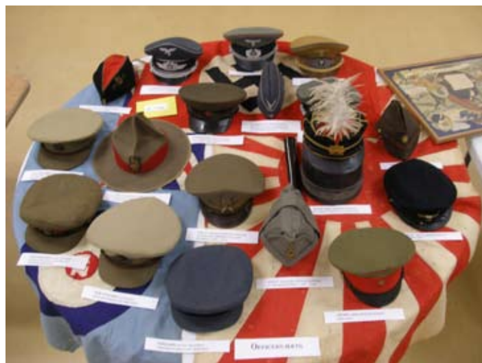
Officers caps from around the globe

Remember to check your Firearms Licence expiry date