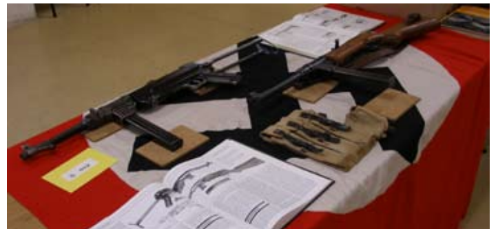
German machine pistols