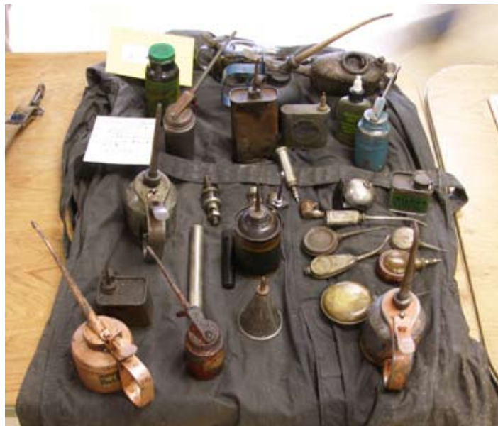
Oil bottles on a Oil skin

Please can everybody make an effort to help out! The same people seem to do the same jobs every year, for the most part they are happy to do it, but a little help from us all will mean we can enjoy the event without too much stress. If you are not sure what to do or how you can help please talk to: Steve, Alwyn or Glenn