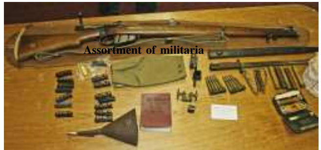
Assortment of militaria