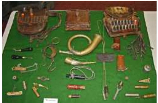
Hunting Horns & Associated Gear