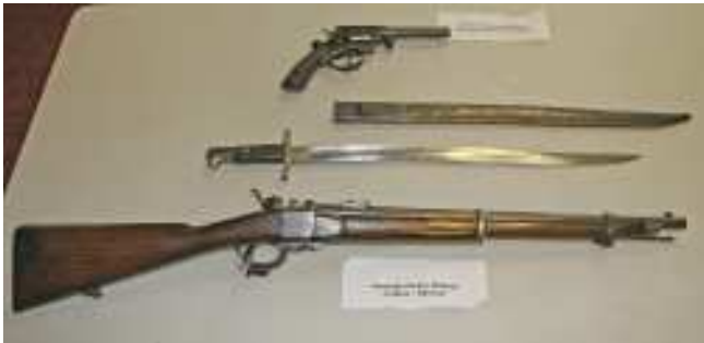
Alexander Henry Carbine & Bayonet

A selection of the quality items that were displayed by members at the May meeting.