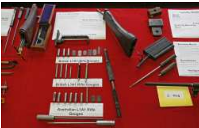
L1A1 Rifle Gauges