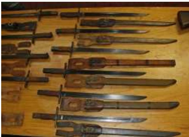
Part of a Collection of Arisaka Bayonets