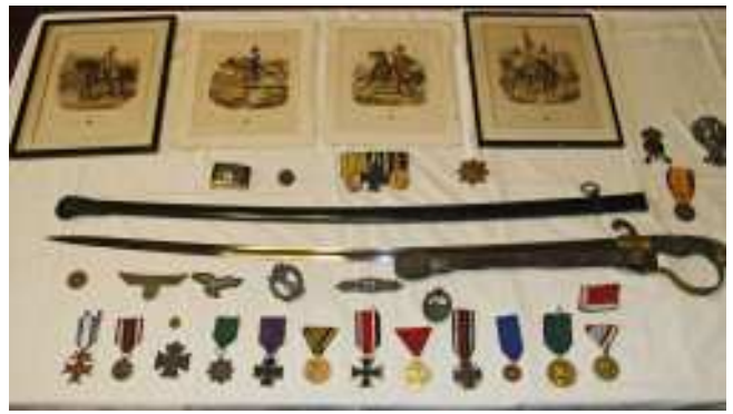
An assortment of militaria