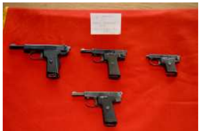
Webley Automatic Pistols