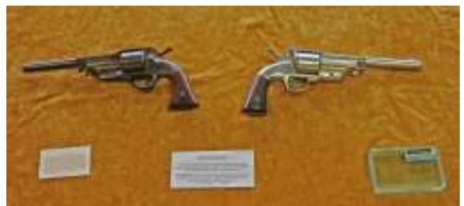
Allen & Wheelock Revolvers