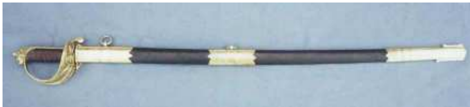
Typical naval officer’s sword of an 1827 model

Naval officers in British society were unique. The navy had, by the late 1600s, made it clear that being a “gentleman” was not sufficient to enter or succeed as a naval officer. Skill, as opposed to social status, was the mark of a naval officer and the navy exercised equality of opportunity at the point of entry over a century before the army saw the merits of such a program. Army commissions, very much the preserve of the nobility, were generally purchased. Naval commissions were granted only after a young teenager had learned his trade, passed his examinations and was selected for promotion on the basis of merit. When wartime required the navy to expand its officer corps, most were drawn from the seaman pool where education and skill in handling ships carried weight; social status carried none. Those aristocrats who did enter the navy found themselves competing on an equal basis with the sons of merchants and labourers. Given that, naval officers