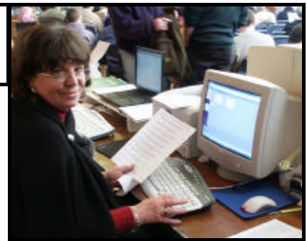
A few photos from the