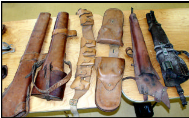
Leather - A few old items including a rifle scabbard marked AC (Armed Constabulary) a US M1 Carbine bucket for fitting on a Jeep or motor cycle, a WW1 Mounted rifle scabbard and 303 cartridge bandolier and pouches.