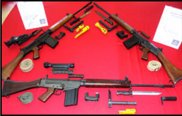
A display of L1A1 Self Loading Rifles at the July