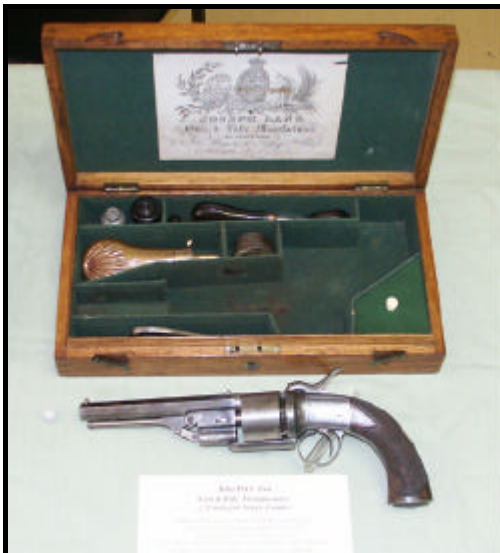
One of the Joseph Lang revolvers this one is the Long Spur Transitional Model Circa