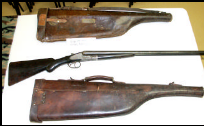
Leige Double Barrelled Hammerless Shotgun with two Leg-of-Mutton carry bags.