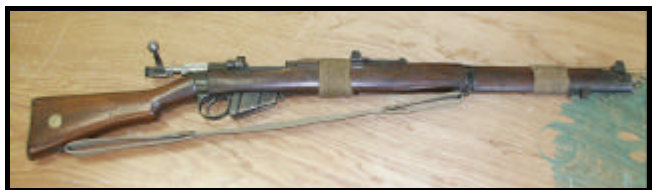
A trusty old Lee Enfield displayed at the July meeting