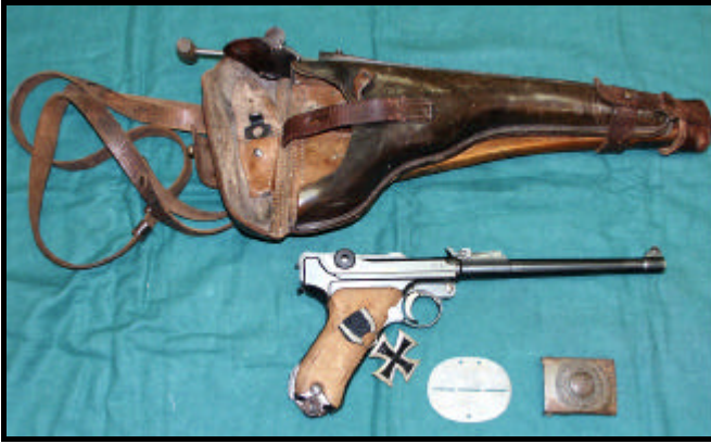
An excellent example of a First World War German Artillery Model Luger pistol complete with its shoulder stock attachment, holster, harness, cleaning rod and stripping tool. The display at our July meeting included a WW1 Iron Cross, German identity tag and Got Mit Uns belt buckle.