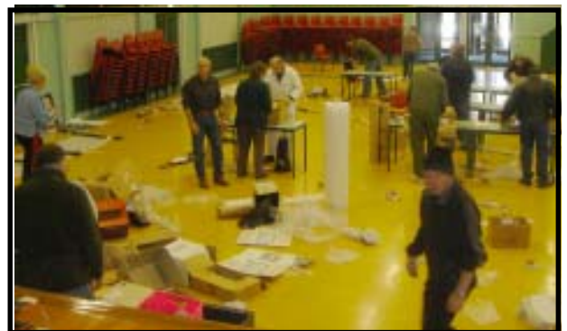
The parcel wrapping hall - when it’s all wrapped up