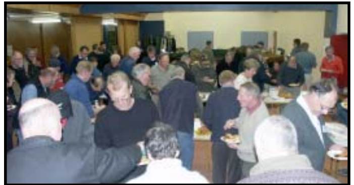
Some of the punters enjoying the buffet on Saturday evening