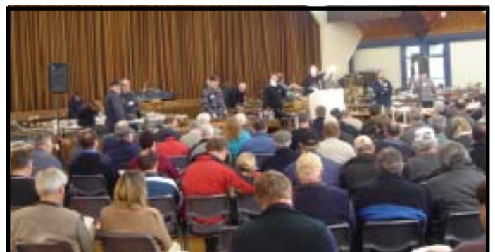
Some of the punters at the start of the auction

Sunday went smoothly with some good prices realized and the auctioneers finishing off by mid-afternoon. Once again a team of willing helpers cleaned up and packed out. My thanks to all who helped. We had a lot of positive comments, however it was unfortunate there had been another auction two weeks beforehand and this disappointment was reflected in a good many of the comments I received.