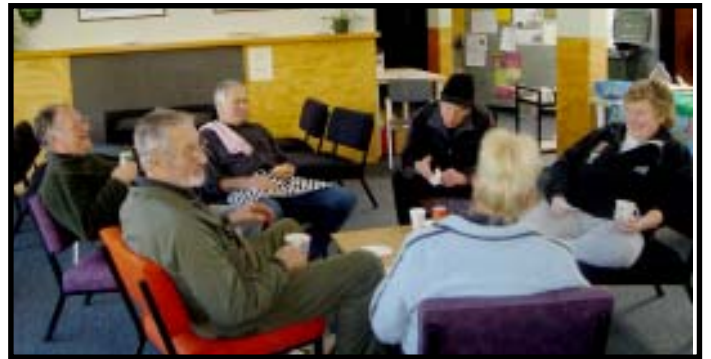
A few of the parcel wrapping team enjoying a cuppa