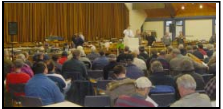
A view of proceedings from behind