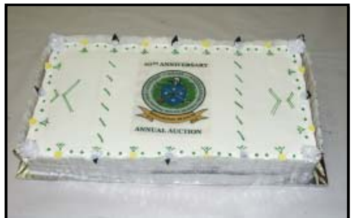
The Anniversary Cake which went down well