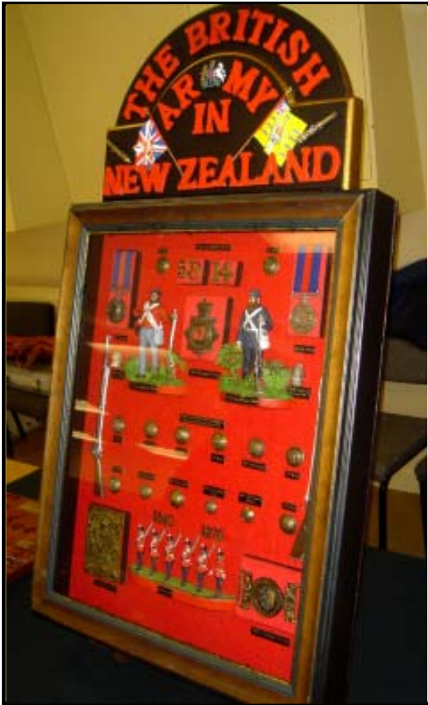
Display illustrating the history of the British Army in New Zealand.