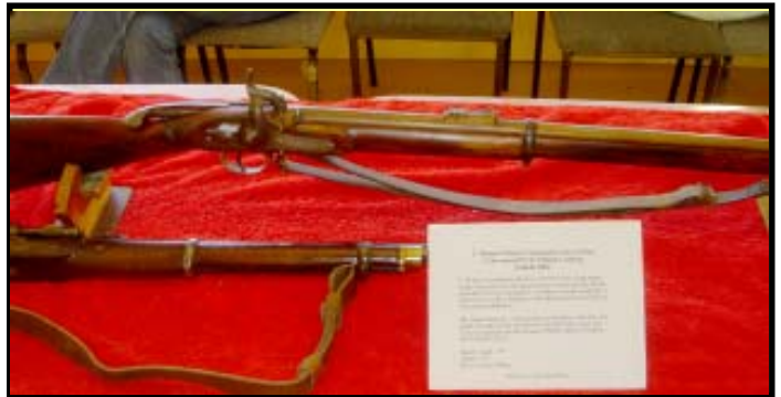
T. Wilson conversion of an Enfield Musket to a capping breech loader

whatever sum was the reserve price. Alternatively he may ask if the vendor is prepared to allow the sale to proceed at less than the reserve price. Generally, in these circumstances the bidding will be reasonably close to the reserve price. If no one is prepared to pay the reserve price the item will be withdrawn.