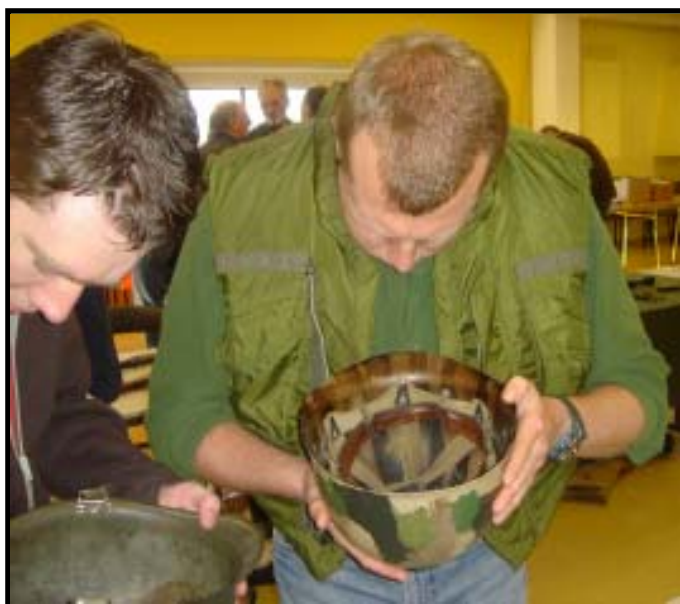
Our guys examining the finer points of a couple of helmets.