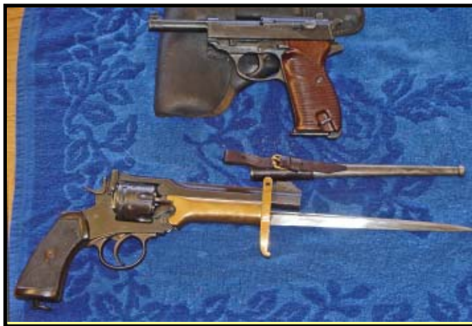
Walther verse a Webley with bayonet. (While some early percussion pistols were fitted with bayonets but these were hardly an effective accessory for modern warfare.)