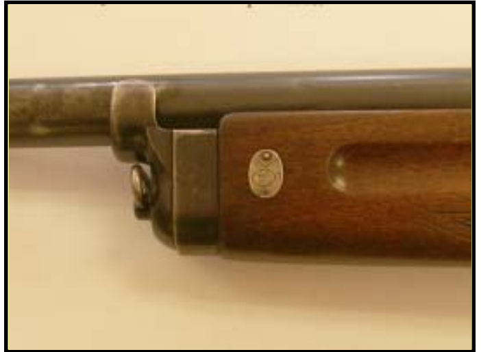
The forend of the Walther 12g Semi Auto shotgun with a small plate engraved with what appears to be OK. If anyone has any knowledge of such a plate the owner of this gun would be very pleased to know about it.