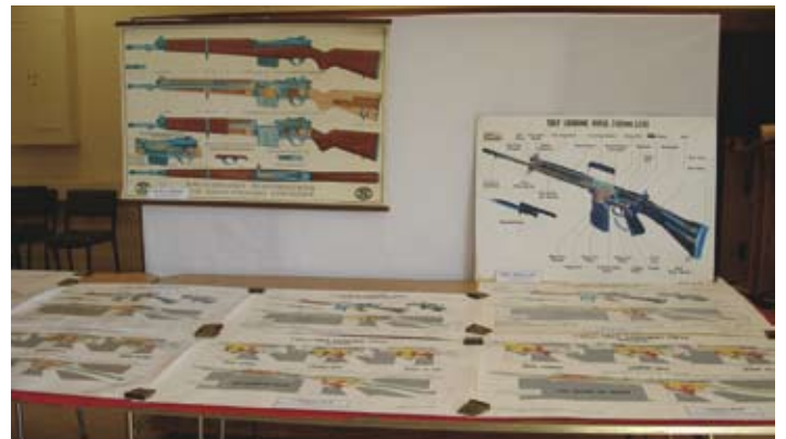
Posters of L1A1 rifle