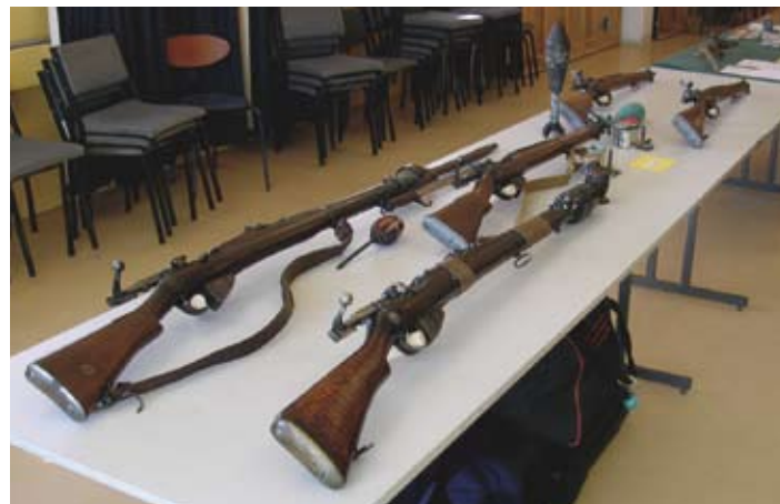
Granade Firing Lee Enfields