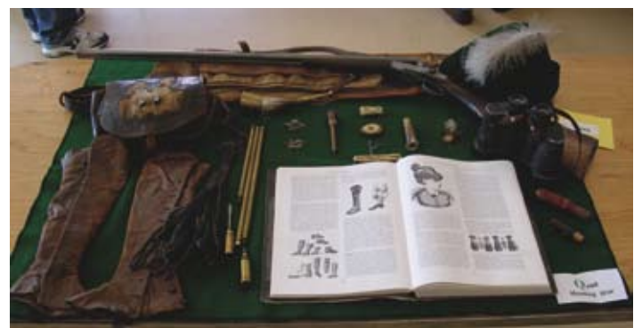
Quail hunting equipment