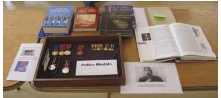
Police books and medals