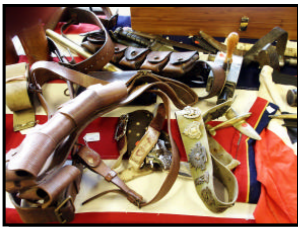
Above and below, selections of items on offer at the swap meet.