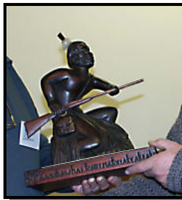
A close-up of the Percival trophy